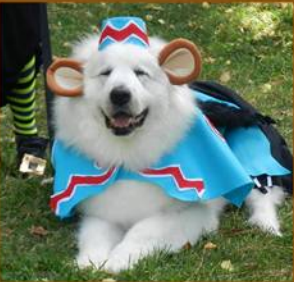
Annual Sacramento Santa Parade

Pyr-Ka-Boo Howloween Event - Fun games, great prizes, good food and big white dogs! A howling good time.